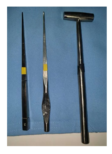
Fig. 1 Dr Ahila's Endoscopic Ear Chisel 1 mm, 2 mm and Mallet

Dr Ahila's Endoscopic Ear Surgery Chisel is straight 1 mm, 2 mm instrument used with a mallet primarily for